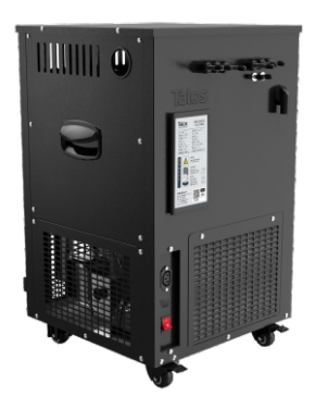
40L Enhanced Enclosed Type Beer Cooler 1084093

Talos warranty period: One (1) years for parts and labor, Two (2) years for compressor (parts only).