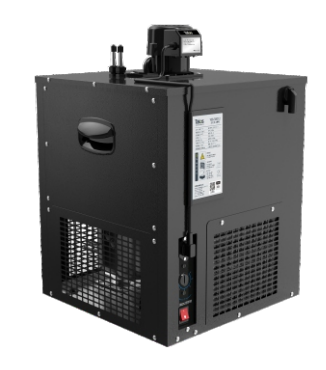
30L Standard Beer Cooler 1083012